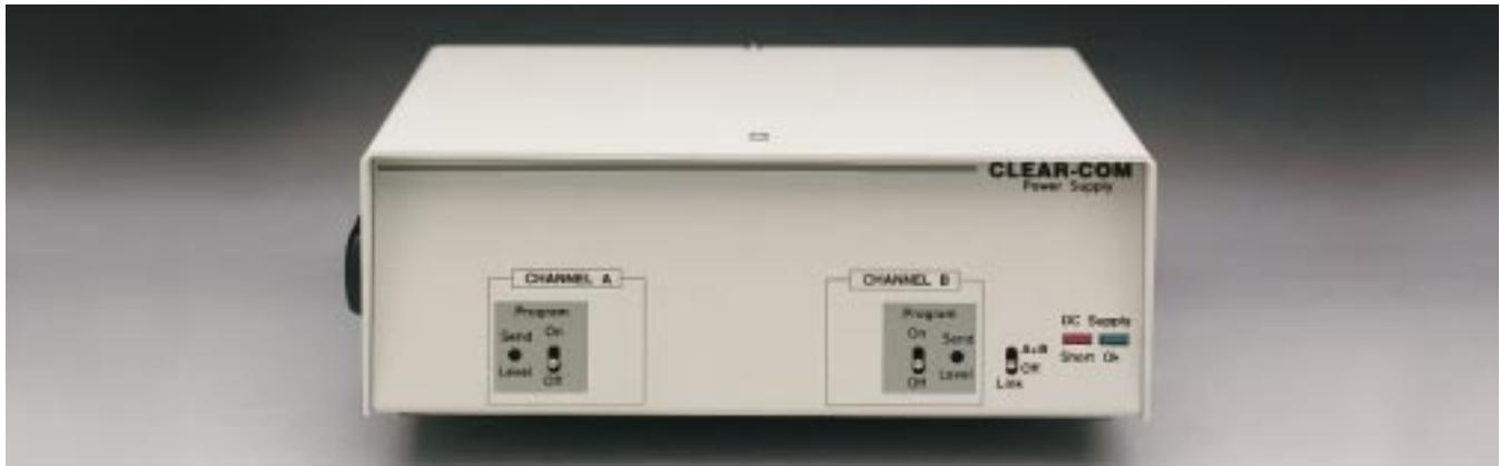
PS-22 Front Panel